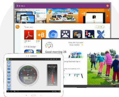
Software, Cloud Solutions and Digital Signage