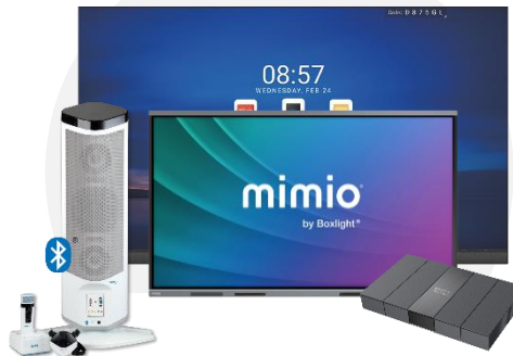
Interactive Displays, Display Walls, & Audio